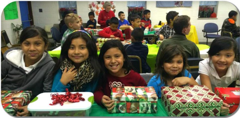
Bethel Kids enjoying Christmas gifts

Bethel Neighborhood Center exists to offer a renewed sense of hope to a multi-ethnic community by sharing material, educational, health, social and spiritual resources that bridge ethnic and economic boundaries.